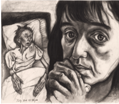
One of Sue Coe's portraits of a woman in a Texas prison.