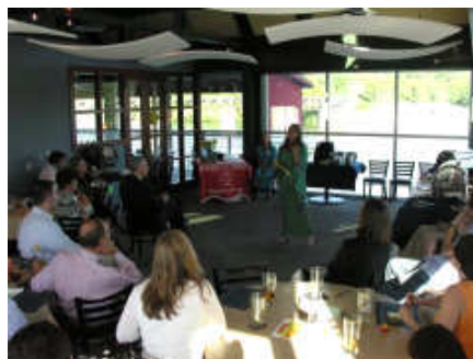
Graduates are sent off with the words of Atticus Finch