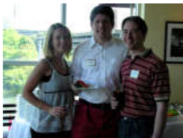
Class of 2007 Grads